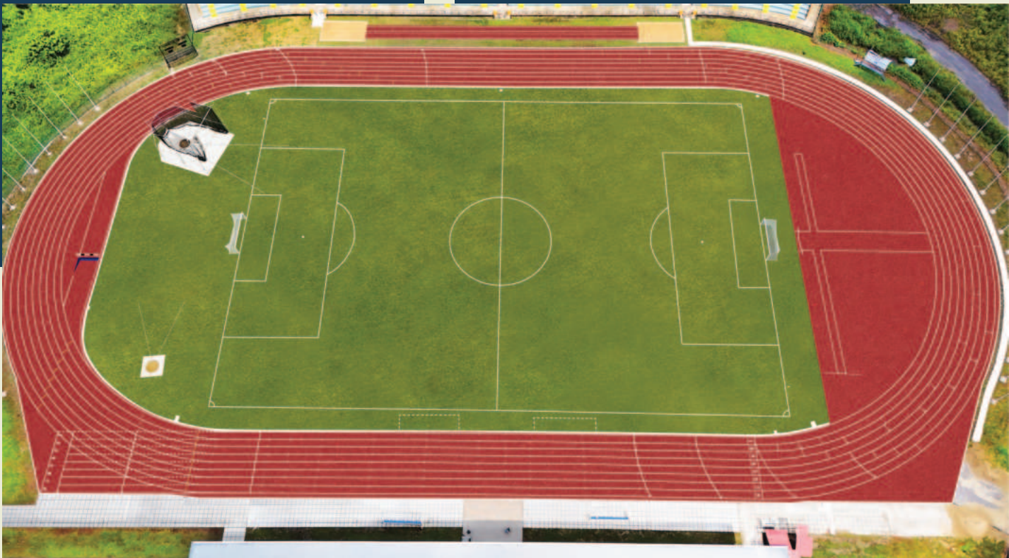
Tun Zaidi Stadium, Sibu

To build sports facilities that are well-designed, functional and sustainable each and every time.